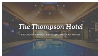
The Thompson Hotel

650 Victoria Street, Kamloops, British Columbia