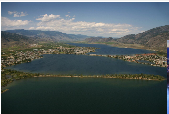
s̓wìws Park (Haynes Point)