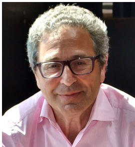
Chair of the Board Hockey Canada 2024