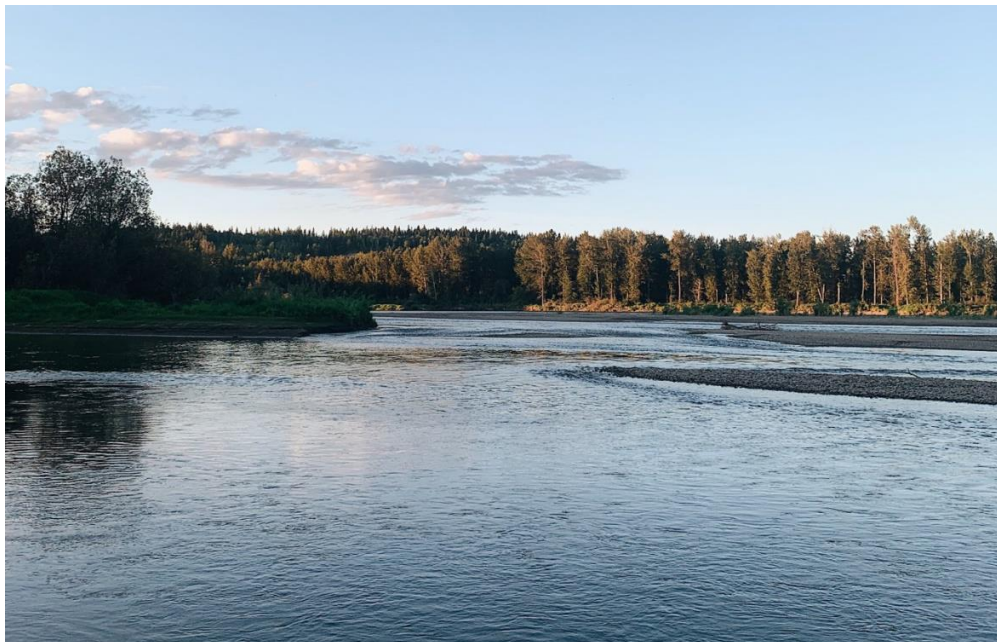
View of Nee Incha Koh from Cottonwood Island Nature Park where the two rivers meet.

We respectfully acknowledge the unceded ancestral lands of the Lheidli T'enneh, on whose land we live, work and play (translated from Dakelh above).